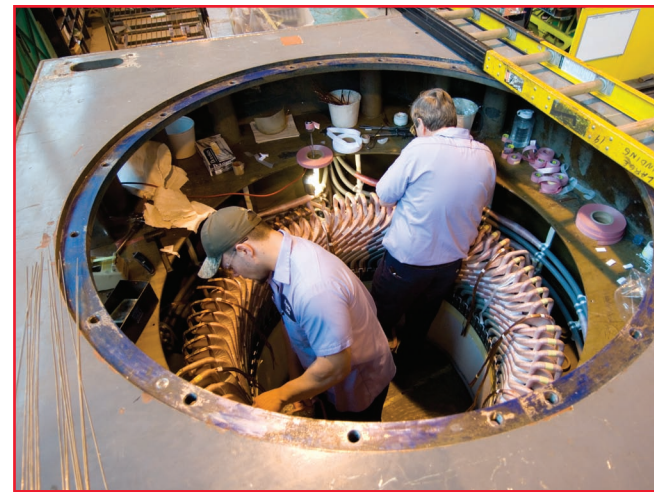
In plant medium and high voltage rewinds