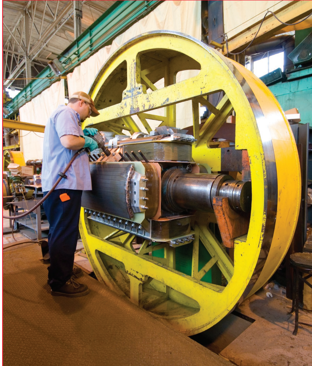
Large vertical winding lathe for winding integral 4-pole rotors

Hyundai Ideal Electric Co. experience... responding with solutions for over 100 years.