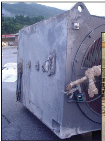
Left: Unit returned damaged Below: Unit after repair